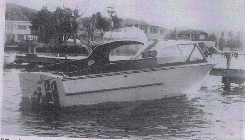
"Contessa III" tied up to the Motuoapa Wharf in 1964