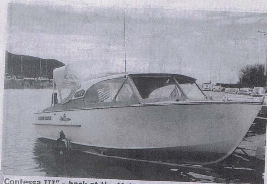
"Contessa III" - back at the Motuoapa Bay Marina after a week-ends fishing on the Lake.

The hull is very strongly constructed with 3/8 5 ply marine plywood on sawn pressure treated tanned white pine frames, and the normal quota of stringers. The